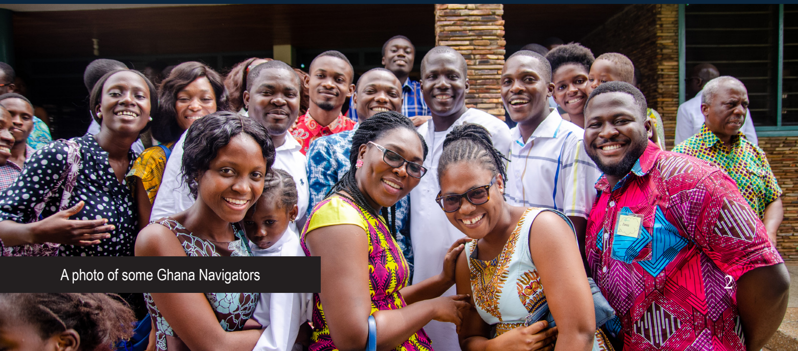
A photo of some Ghana Navigators

WE ARE DISCIPLES. WE ARE DISCIPLEMAKERS.