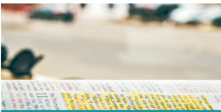
BIBLE READING & MARKING | PG 6