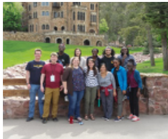
Team leaders and some staff members

I am highly grateful to God and the Navigators for giving me this opportunity of a lifetime — a taste of heaven!