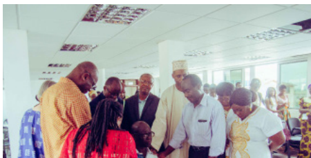
LEADERSHIP TRANSITION | PG 3