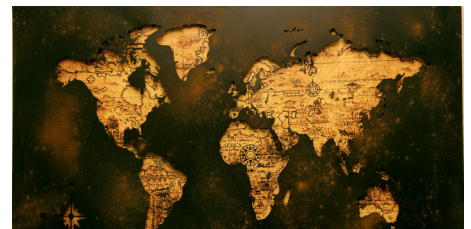
TO GO OR NOT TO GO | PG 5