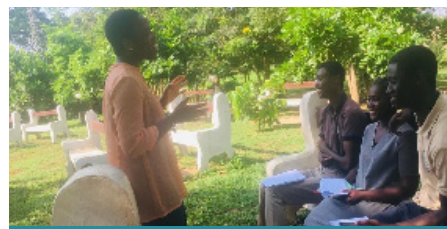
NEWS FROM CAPE COAST | PG 7